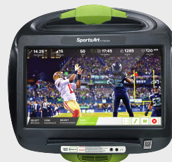
16 in. SENZA™ Touchscreen (Requires Power)